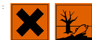
Xn - Harmful